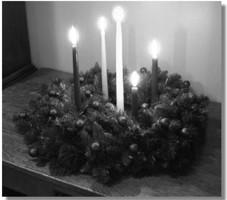
"But the angel said to them, 'Do not be afraid. I bring you good new of great joy that will be for all the people. Today, in the town of David,

a Savior has been born to you; He is Christ the Lord.