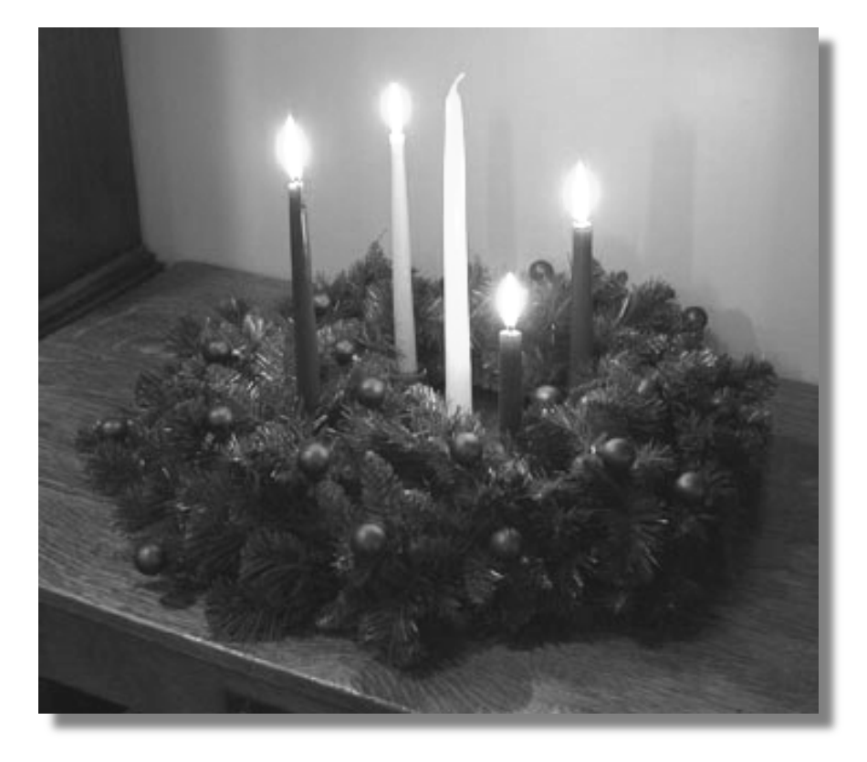
"Jesus said, I am the light of the world; 'he who follows me will not walk in darkness, but will have the light of life'" - John 8:12

This first candle reminds us of the light of HOPE of the prophets.