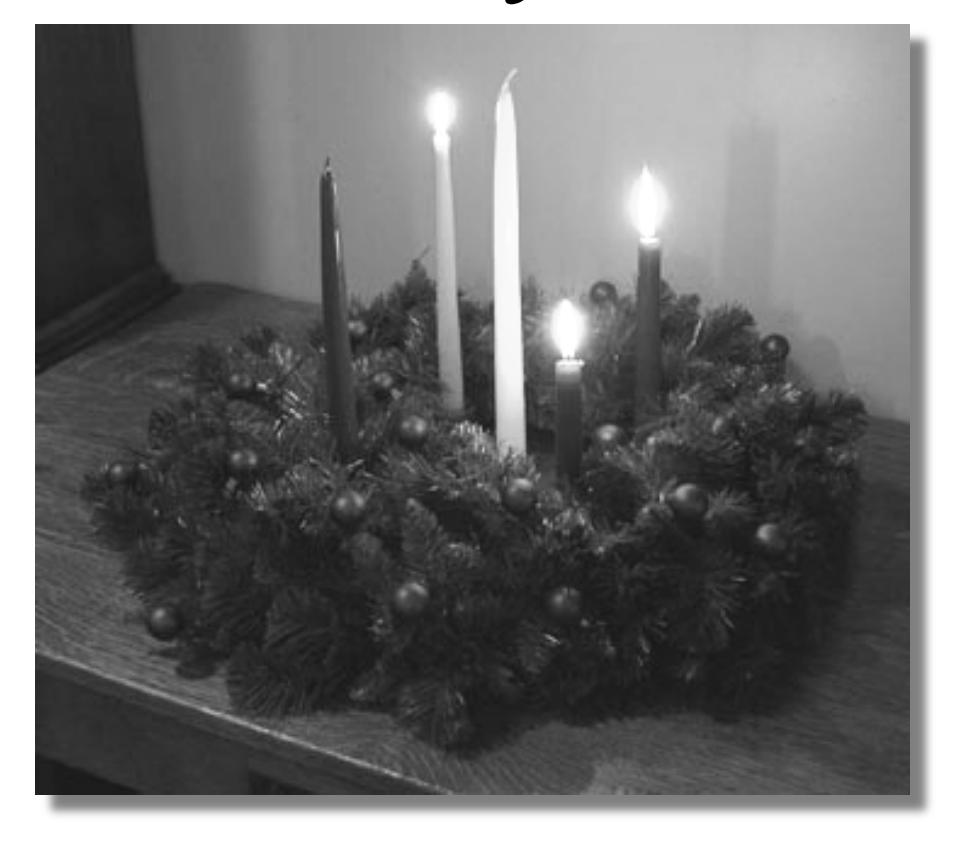
"Jesus said, I am the light of the world; 'he who follows me will not walk in darkness, but will have the light of life'" - John 8:12

This first candle reminds us of the light of HOPE of the prophets.