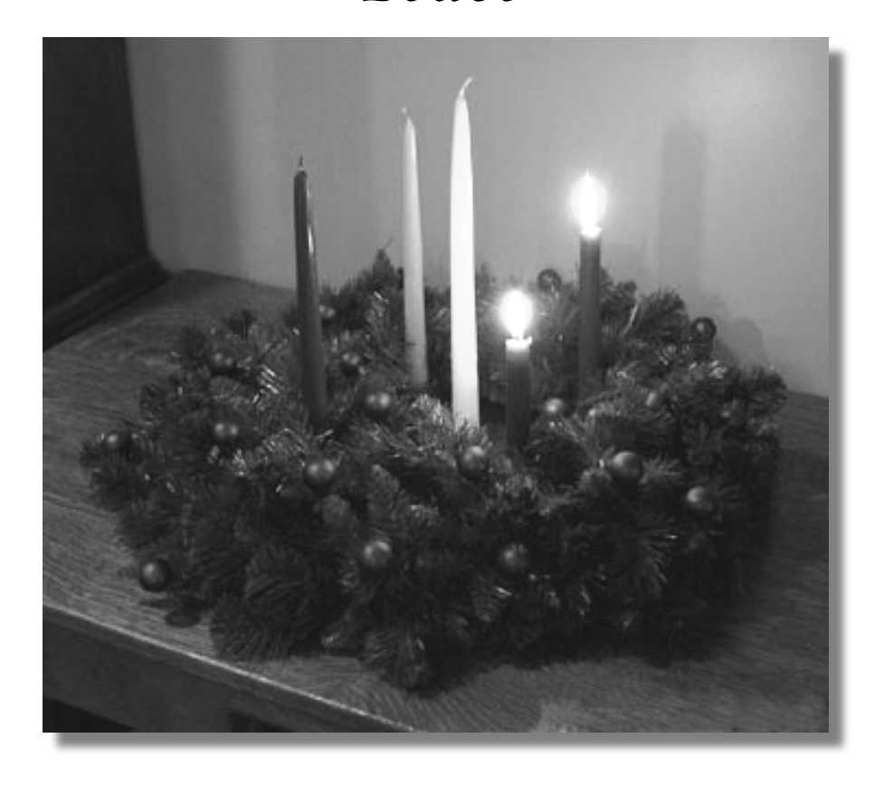
"Jesus said, I am the light of the world; 'he who follows me will not walk in darkness, but will have the light of life' " - John 8:12

This first candle reminds us of the light of HOPE of the prophets.