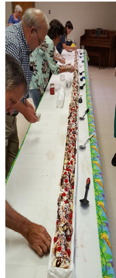
2019 VBS "Giant" Banana Split