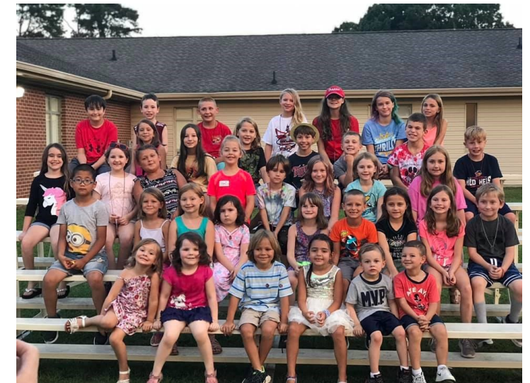
2019 VBS Kids