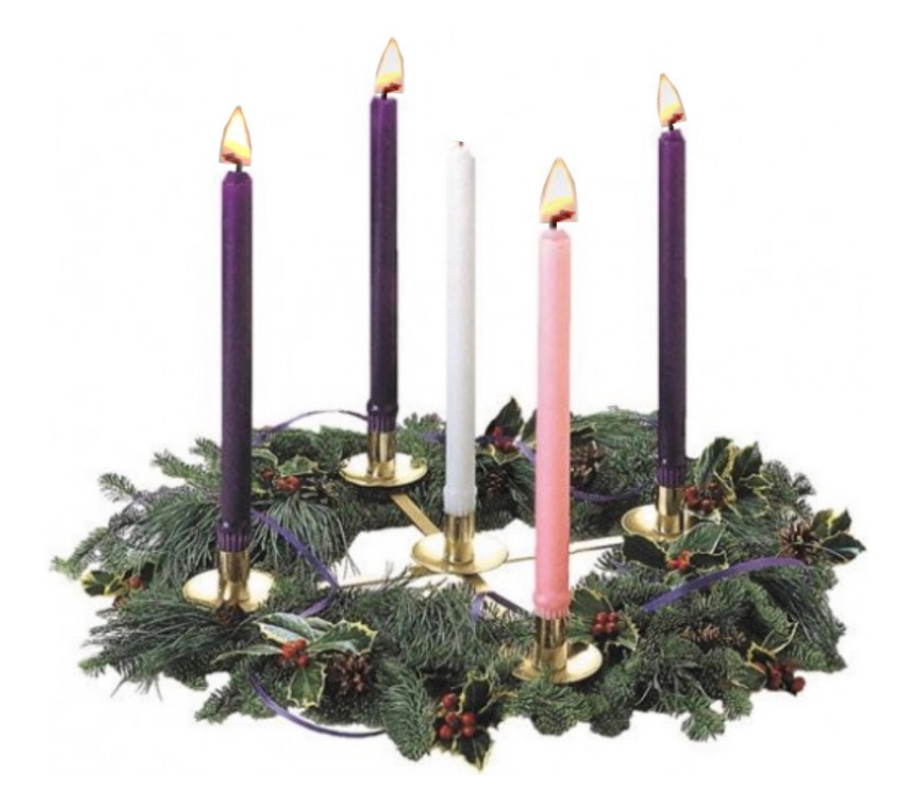
"Jesus said, I am the light of the world; 'he who follows me will not walk in darkness, but will have the light of life'" - John 8:12

This first candle reminds us of the light of HOPE of the prophets.