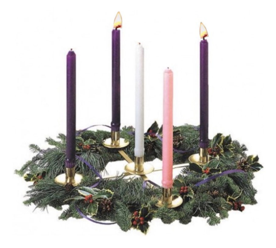
"Jesus said, I am the light of the world; 'he who follows me will not walk in darkness, but will have the light of life'" - John 8:12

This first candle reminds us of the light of HOPE of the prophets.