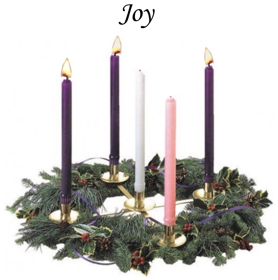
"Jesus said, I am the light of the world; 'he who follows me will not walk in darkness, but will have the light of life'" - John 8:12