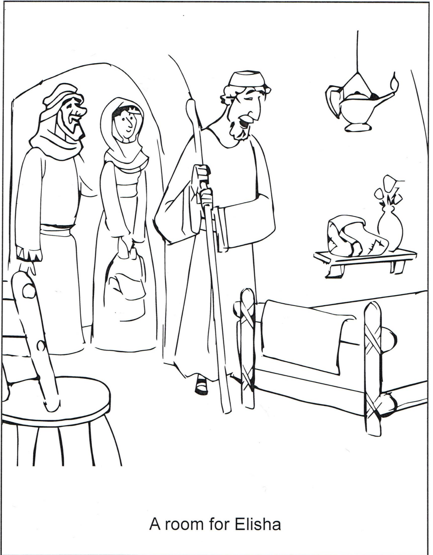
A room for Elisha