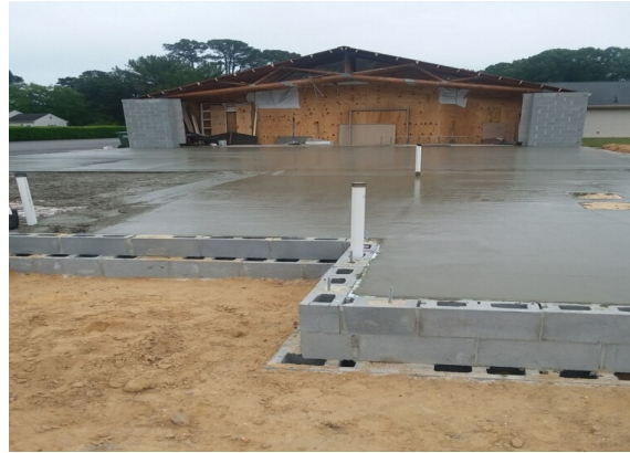
Day 50-Foundation Poured