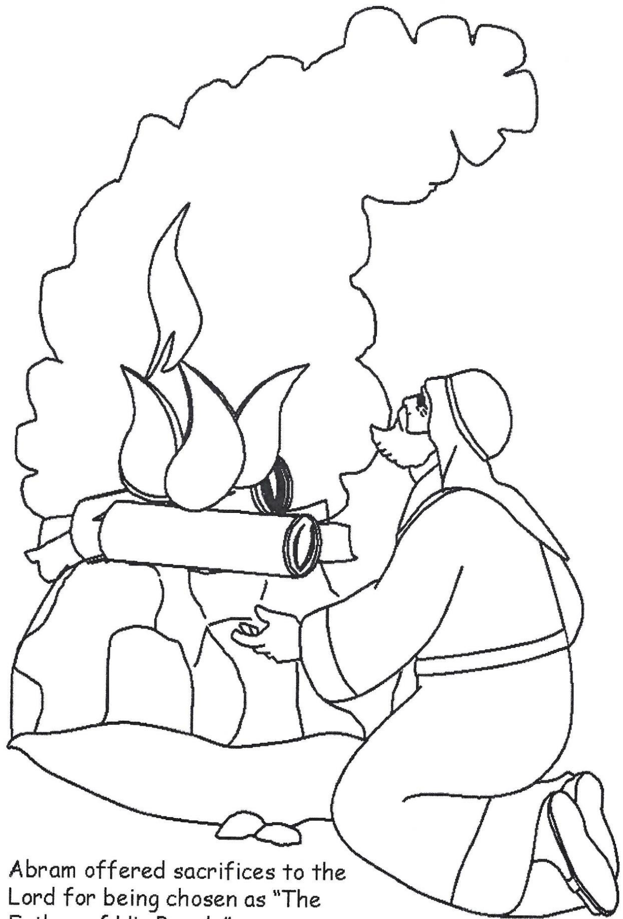
Abram offered sacrifices to the Lord for being chosen as "The Father of His People"