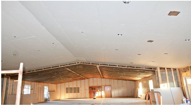
Day 110 Sheetrock!!