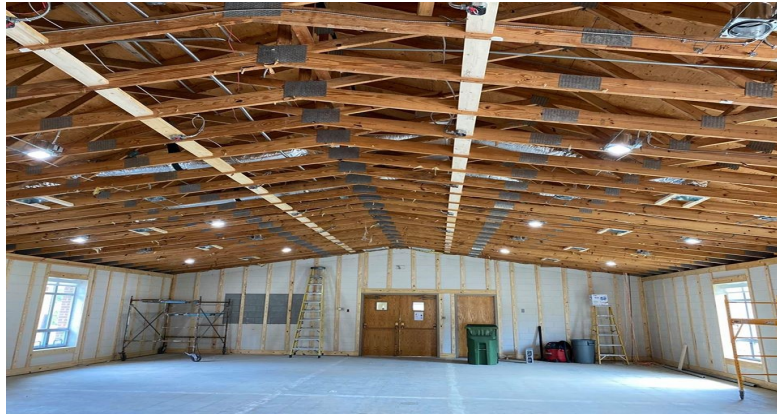
Day 100 Lights!!